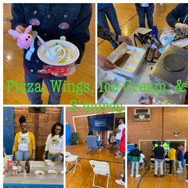
Pizza, Wings, Ice Cream, & S'mores

Thanks to the cafeteria staff for Our St. Patty lunch. It was Green-licious!