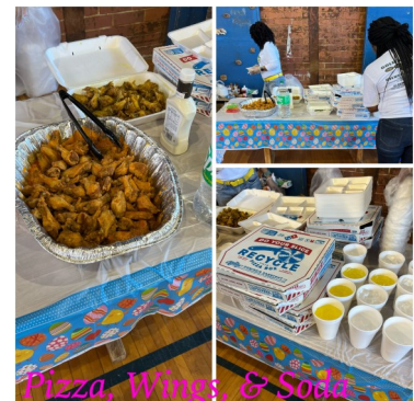
Pizza, Wings, & Soda

Ault Academy teachers and staff Rock! For the month of March we had 26 out of 32 students to make PBIS. Due to inclement weather prior to we started this event with a moment of silence for all the people who lost their homes and things during the tornado. We celebrated with Easter themed activities and a variety of game stations throughout the Bradfield Center gym. The students ate pizza, wings, made s'mores, and had ice cream with their choice of toppings. Once again Thanks to all the people who donated to make this event another success.