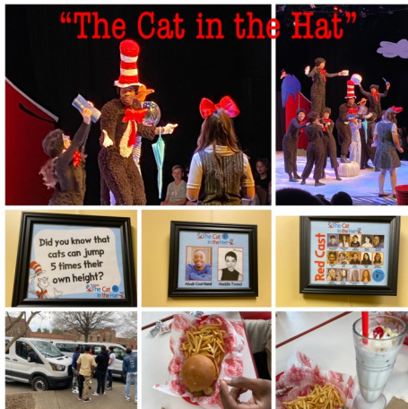
"The Cat in the Hat"

The week of February 27th through March 3rd ended Our Black History Festivities. This group went out with a BANG when I say "Fish Fry" I mean fresh hot out the grease fish. Thank Yall!