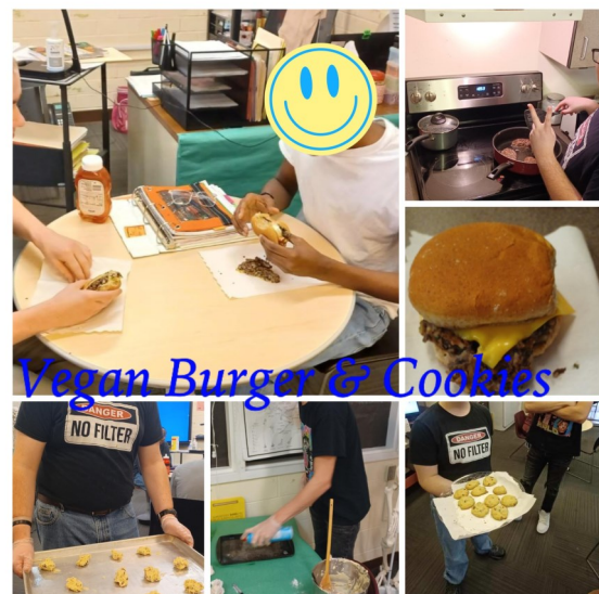
Vegan Burger & Cookies