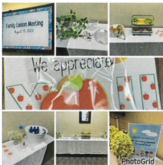
First Family Liaison Meeting of the 2023-2024 school year @ ASC Building.